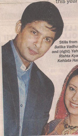
Stills from Balika Vadhu and (right) Yeh Rishta Kya Kehlata Hai