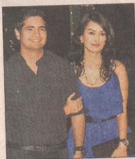
Karan Mehra and Nisha Rawal