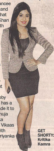
GET SHORTY: Kritika Kamra